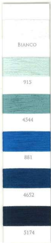
This colour card has been produced on basis of Sahel 2/60 Nm Reproduction of the colour shades may vary for other qualities