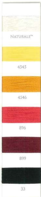
Available colours for sampling: Seler G 800 Nm* Seler 800 Nm*