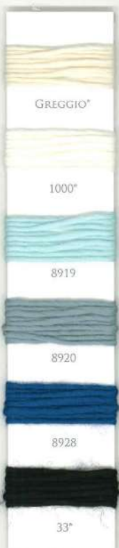
This colour card has been produced on basis of Loirs 1700 Nm Reproduction of the colour shades may vary for other qualities