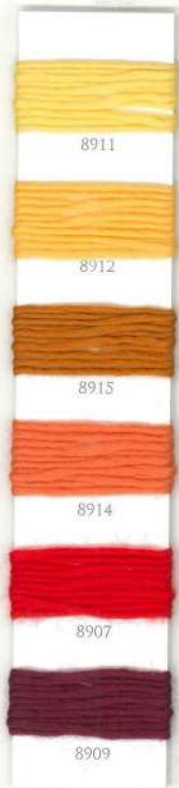
Available colours for sampling*