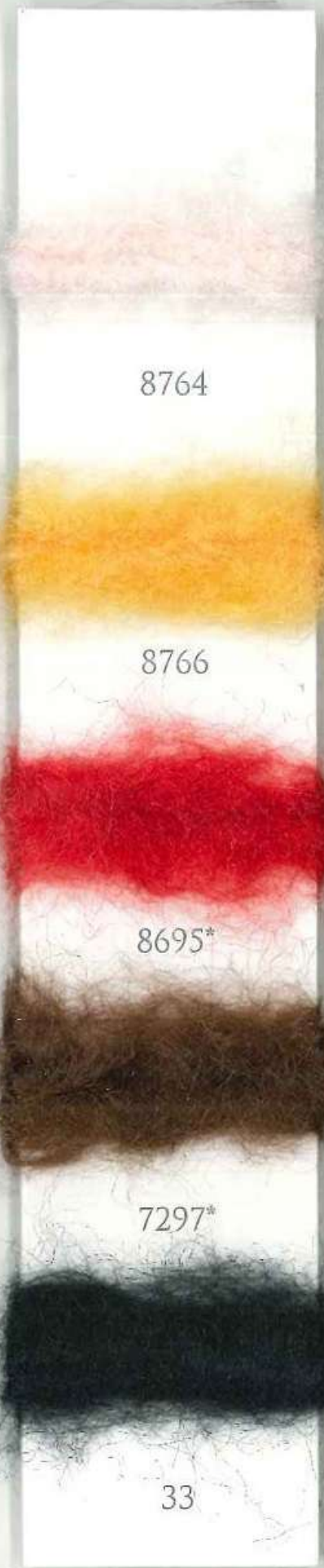
Available colours for sampling*